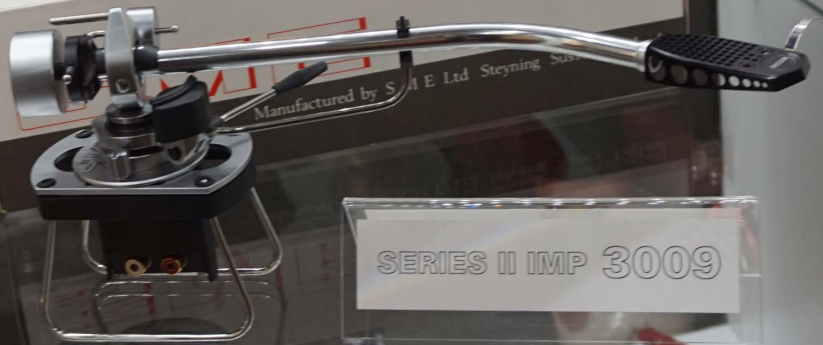
SERIES II IMP 3009